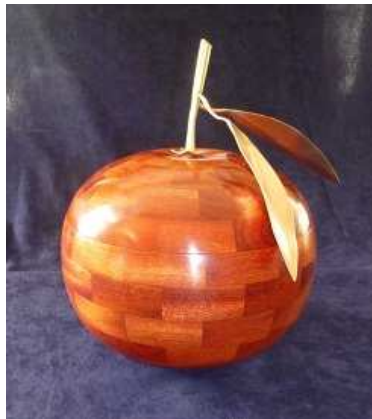
Tangerine fruit box by Norm Hix