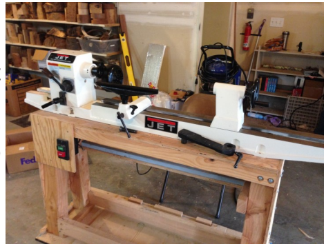
The lathe we used & to be auctioned.

If you did not sign up for a 'tour of duty' at the fair, don't let that stop you. Drop by the exhibit and lend a hand at talking about what it is that impassions you. A side benefit is a chance to meet a new member of the club that you had not had the opportunity to talk to before. It's always interesting to peel a layer of the onion back and discover someone that you might have more in common with than just turning. —JTC