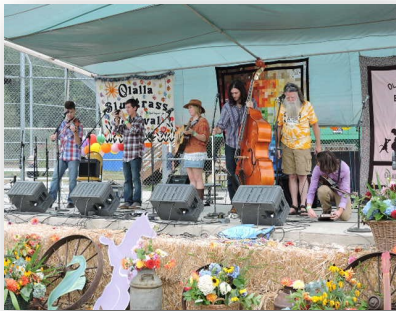
The Blackberry Bushes play at the Bluegrass Festival.

Your club's board decided that it would be a great opportunity to expose more of the peninsula to what we