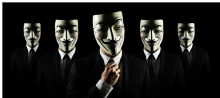
Unable to photograph the new Board, the masks will be removed in the next newsletter.