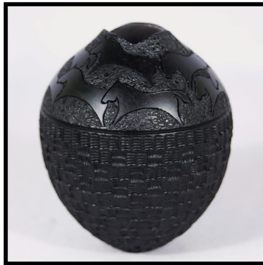
A Molly Winton creation

There is one space available for the Miniature Turning Class and seven for the Pyrography. If you are interested or would