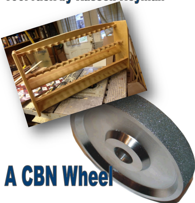
A CBN Wheel