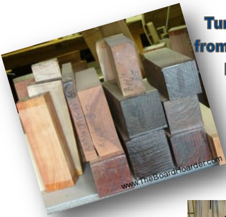
Turning wood from The Board Hoarder