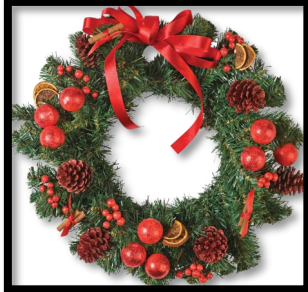
My guess at what it might look like.

It would be helpful if you called the school ahead of time 360-377-4542, by Monday (the 26th), to make certain they have enough. If no one answers, please leave a message, and they will get your name on the list.