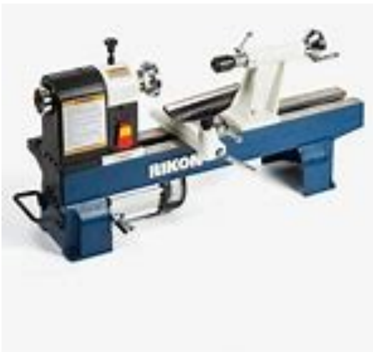
Rikon Midi Lathe 70-150VSR Variable speed