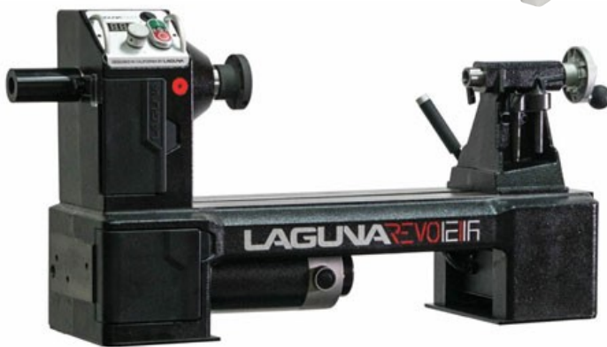
Laguna Revo 1216 EVS Variable speed