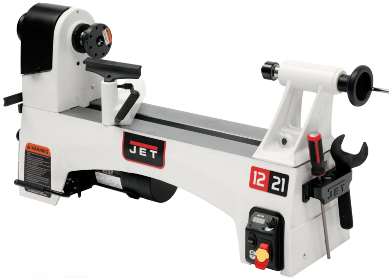
JET 1221 Variable speed

These are the lathes the board is considering . If you have comments , and or, own one of these please let us know what you think