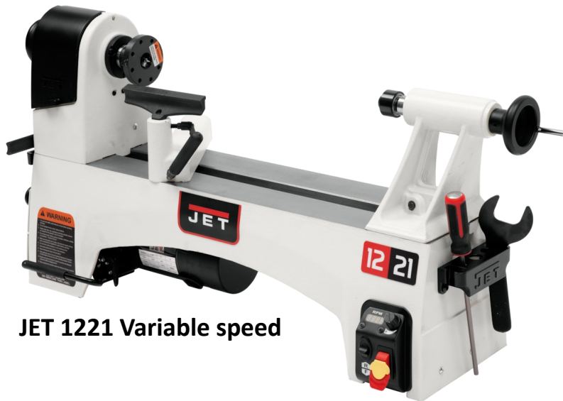
JET 1221 Variable speed

OPCAAW has ordered 5 of these Midi Lathes that will be used at our sawdust sessions. We are also planning on holding classes taught by our members and by guest wood turners . We are looking for a volunteers that would work with our VP of Training , Larry Lemon , to schedule and assist in the preparation of these classes. We are purchasing the lathes from one of our sponsors, Sumner Woodworking, and due to Covid there is a 2-3 month waiting period for the lathes. So we have plenty of time to get ready