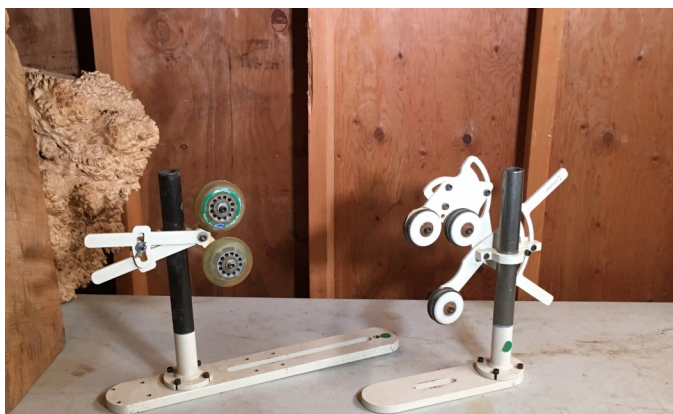
The one on the left is a Oneway bowl steady rest and the one on the right is a spindle steady rest

OPCAAW has received a very large donation of tools and we are in the process of inventorying what we have and how we are going to sell the items. At this month's meeting we will auction the items pictured below along with some other items