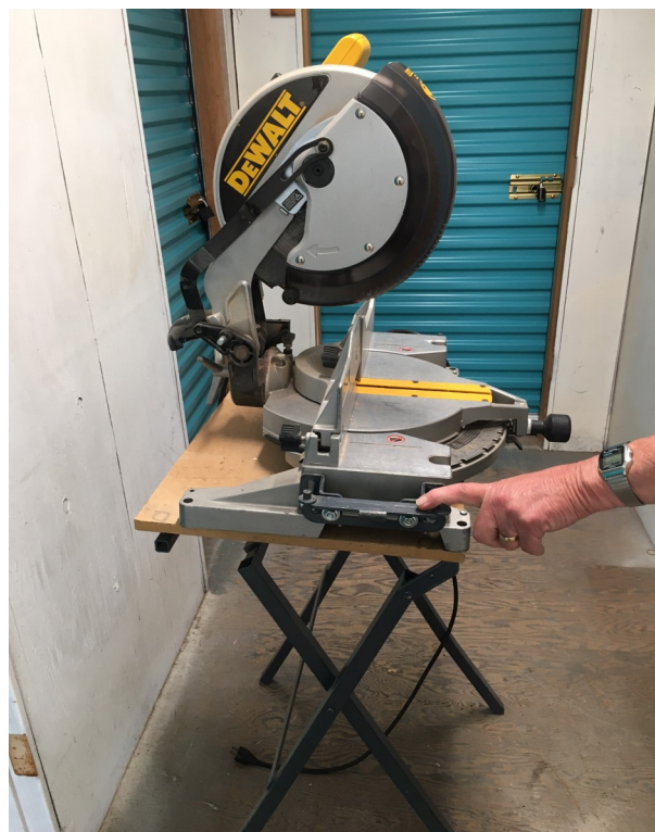
This Dewalt Chop Saw with the stand will be auctioned at the meeting as well.