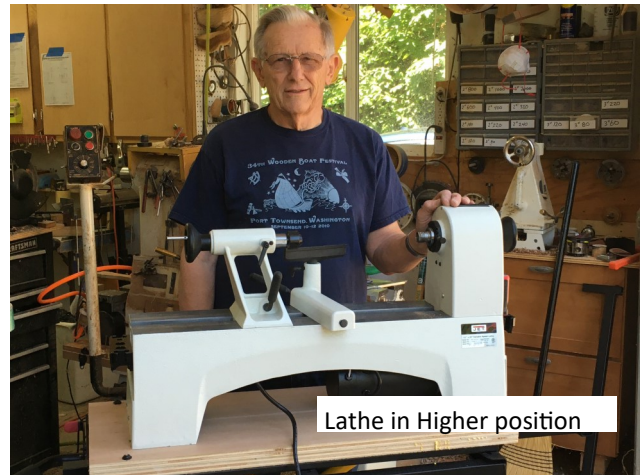
Lathe in Higher position