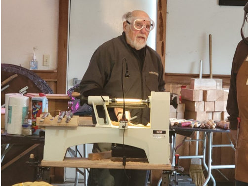
Beginning Spindle Turning Class

Class fees vary by location and subject. These costs are a reflection of renting the space, transportation of lathes and equipment, as well as other miscellaneous expenses. The material fees are to cover the costs of the wood that is used for the class.