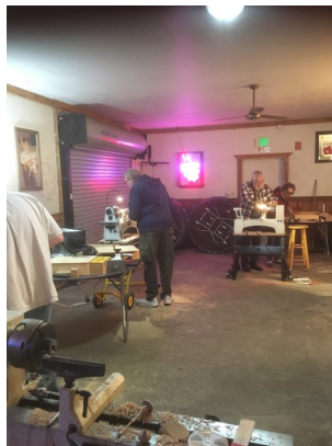
Holiday Ornament Turning Class