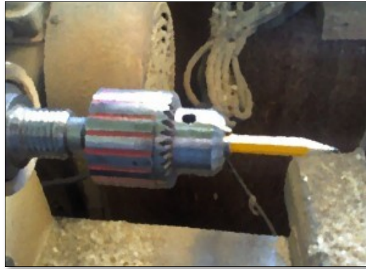
Am I the only one who has sharpened a pencil this way?

• When you tear out the bottom seam in your shop shirt pockets so they don't fill up with shavings you're absolutely a woodturner.