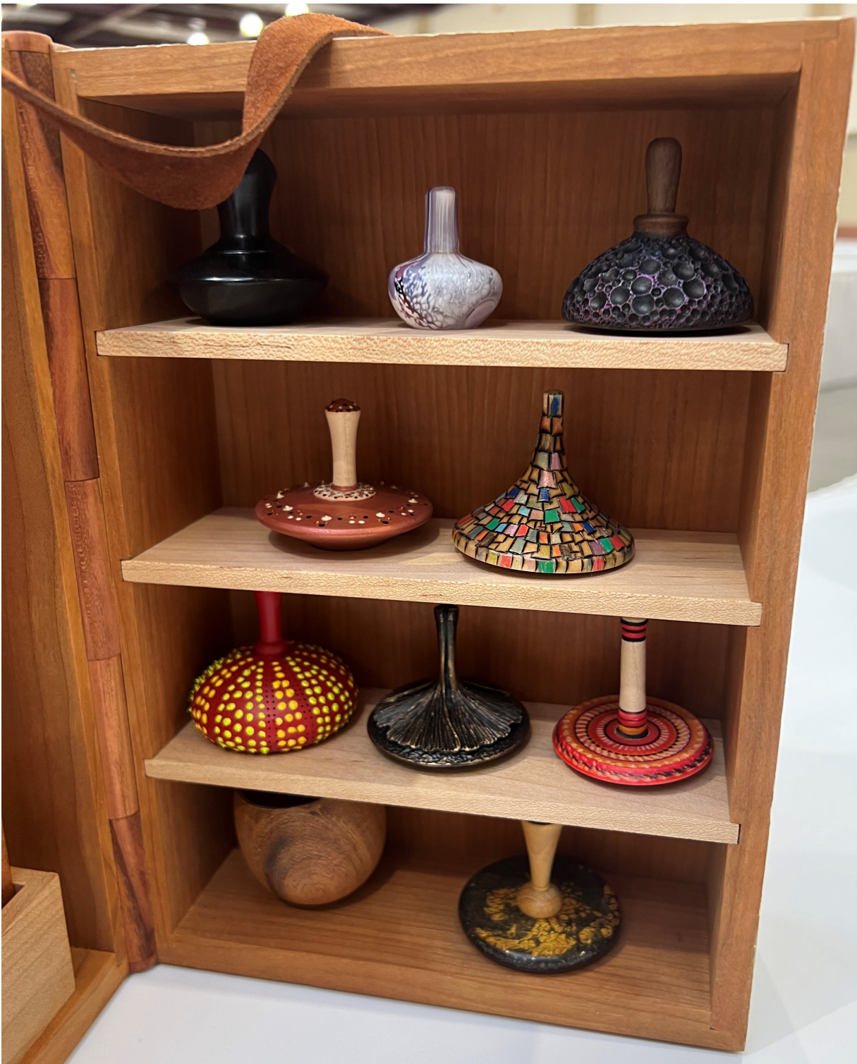
Some Tops from the 2022 AAW Symposium in Chattanooga, TN.

Since we have a couple of top turning sessions at the school, I thought this might be a bit of inspiration... It's eye candy for me!